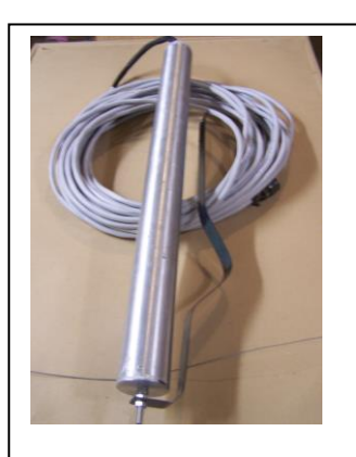
The C400 borehole microseismicity monitoring sensor

Our S-400 seismic sensor design is based on our favorite S-100 three-axis seismic sensor, mainly used in Passive Seismic Tomography applications. The NEW S-400 seismic sensor has specially designed for surface installation in oil & gas fields, into small diameter boreholes in order to keep the installation cost low. Installation depth can be up to 200m, but usually the suggested installation depth is 10 - 50m depending on the level of background noise.