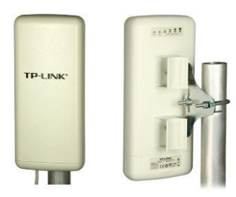
FHWi-Fi wireless bridge