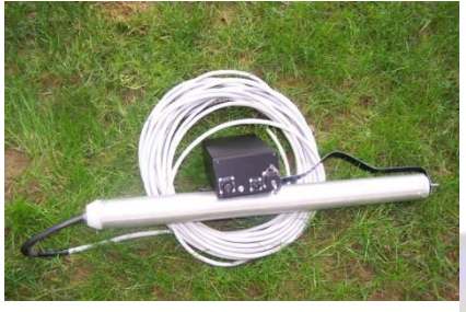
SRi32 Digitizer/Recorder and C400 sensor

The firmware runs only the acquisition, filtering, timestamping, processing and storage functions. The data are also available in serial / Ethernet port of the instrument in real time. Thus, the real time data stream can be sent directly to the acquisition PC for real time processing.