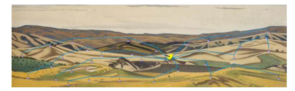
Real Time Telemetry Fracturing / Microseismic Network