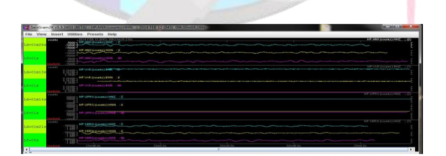
Real Time Telemetry over Seiscomp/SeedLink